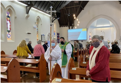
Wearing masks, sanitising hands and following the 4 square metre rule are now the norm