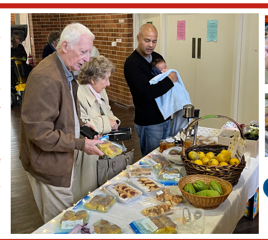
Sunday 19th June the Biggest Morning Tea fundraising event, was the Cancer held for Council. Delicious morning tea and a trading table raised $210 this for worthwhile cause.

Royal Far West, in partnership with the Mid North Coast Local Health District, held the Healthy Kids Bus Stop in our Parish Hall 7th-8th June. This was a free child health care check and pathway to care programme for children ages 3-5, which included a comprehensive health check, hearing check, vision check, fine and gross motor skill assessment, and food and nutritional assessment. 30 local families participated.